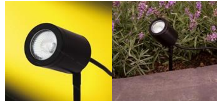
Hunza light fittings on remote switching