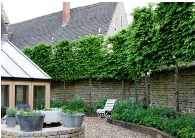
Pleached evergreen trees for screening planted in new raised bed behind garden building.