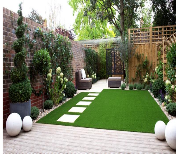
Easigrass Chelsea, laid on 18mm shock pad.

http://www.themalverncollection.co.uk/product/index/id/61