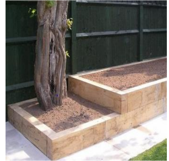
Green oak railway sleeper to be used as edging and retaining walls.

http://www.easigrass.com/types-of-artificial-grass/easi-chelsea/