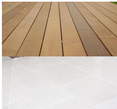
Hardwood decking or paving to match existing for garden building veranda.