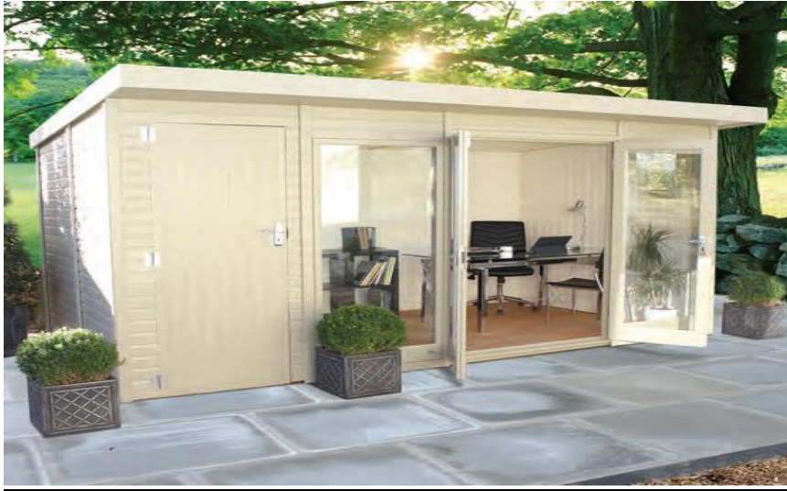
Malvern buildings pent office -

http://www.themalverncollection.co.uk/product/index/id/61